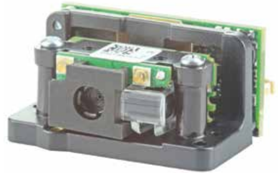
N5680 Decoded 2D Imager

Adaptus 6.0 also includes a completely redesigned software architecture that leads the industry in its ability to decode hard-to-read barcodes. Built-in versatility with various available options enables N5600 engines to meet the requirements of a wide range of applications. Backed by Honeywell's expert OEM integration support, and proven quality and reliability, N5600 engines provide value to OEM customers by providing enhanced data capture solution, reducing development investment, and decreasing total ownership costs. N5600 series engines are available as imagers with either a hardware decoder, for easy integration, or a licensed software decoder for space and power-constrained applications such as mobile terminals.