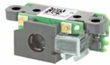
N5600 Undecoded 2D Imager